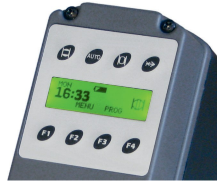
Built-in quartz controlled timer with LCD display