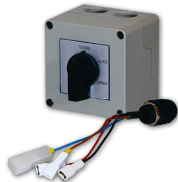
Remote control option.