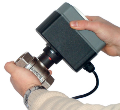
Should there be an electrical power failure, then the ball valve can be manually opened or closed